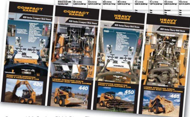
Case - 400 Series Skid Steer Flyer