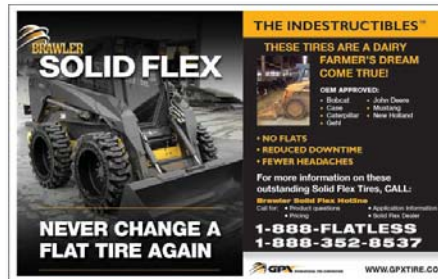
GPX - Brawler Solid Flex Tire Ad