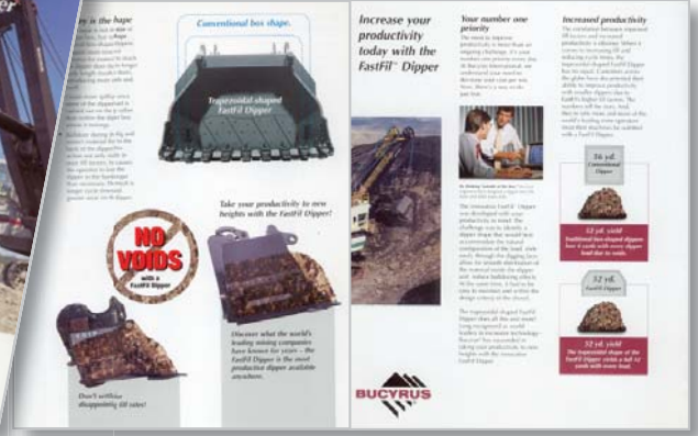
Bucyrus - Innovation Brochure Series