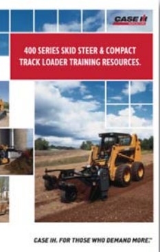
Case - 400 Series Skid Steer Sales Training Resource Catalog