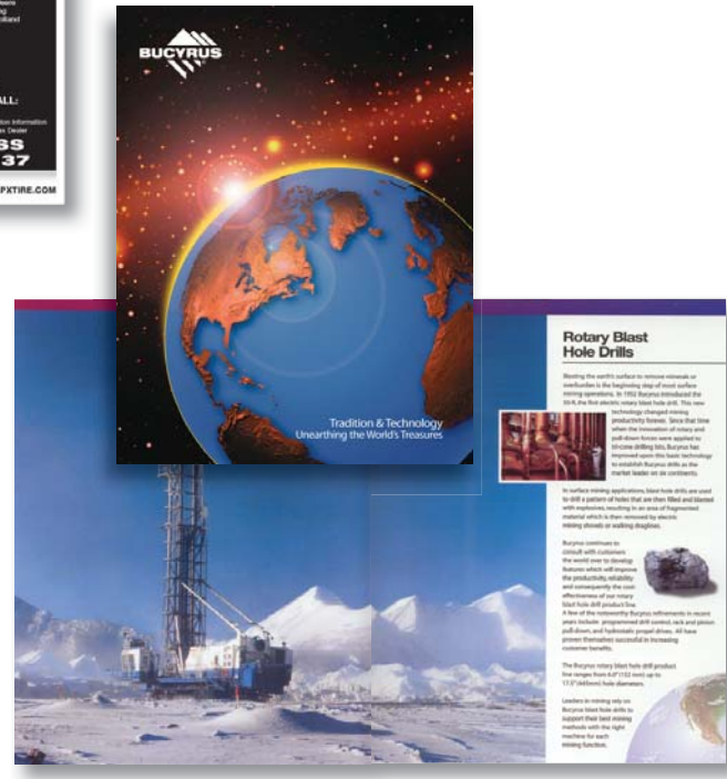
Bucyrus - 12 Page Brochure