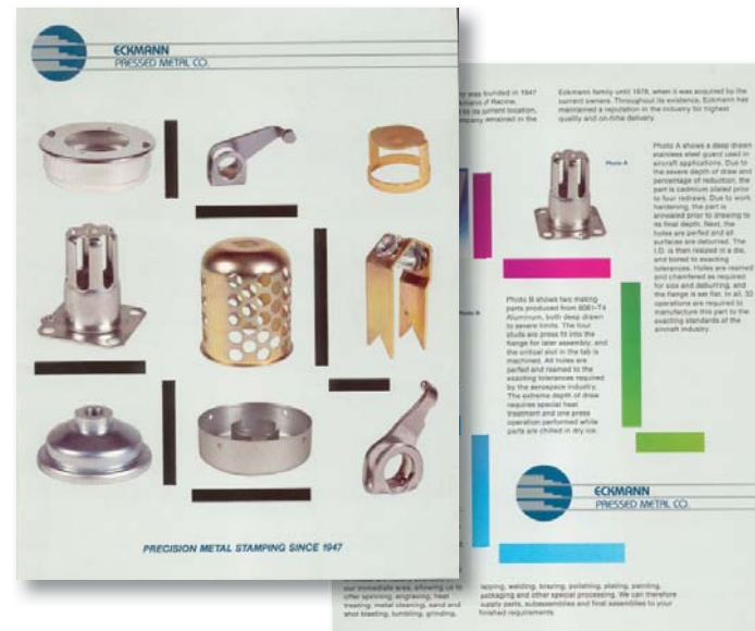
Eckmann - Die Cut Brochure