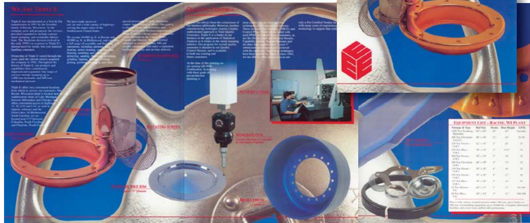
Triple E - Sales Brochure

Precision manufacturing requires tooling engineered to perform dependably in any market. Visually bold communications that feature custom designed tools and components provide customers with a positive view of your tool room services and capabilities.