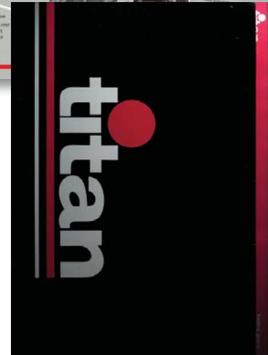
Titan - Pocket Folder & Insert Sheets