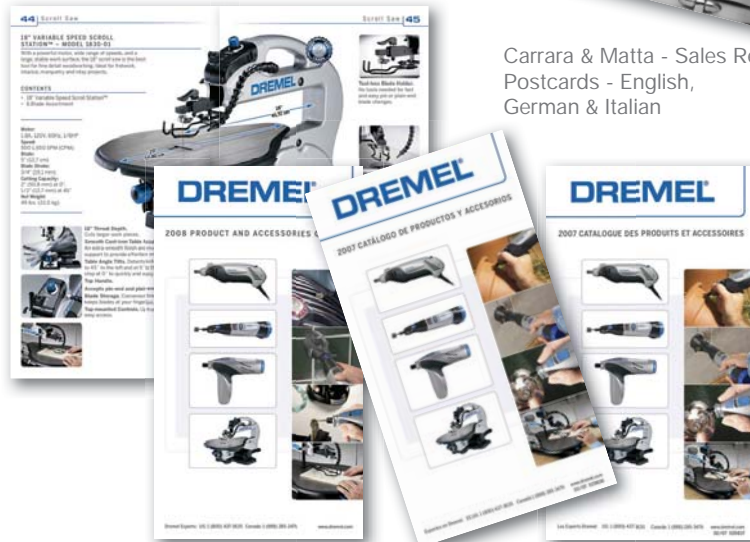
Dremel - Product & Accessories Catalogs - English, French & Spanish