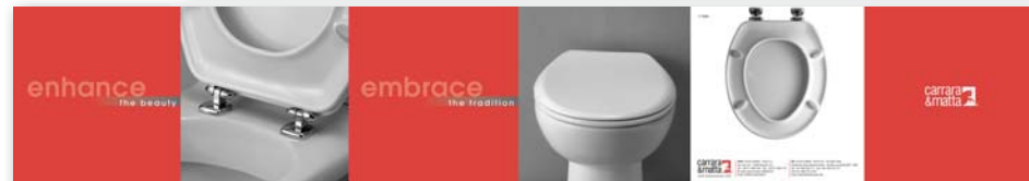
Carrara & Matta - 5" x 5" Brochures - Dutch, English, French, German, Italian, Spanish