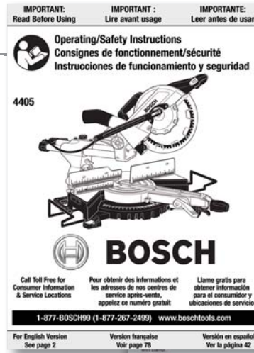
Bosch - Operations Manual - English, French & Spanish