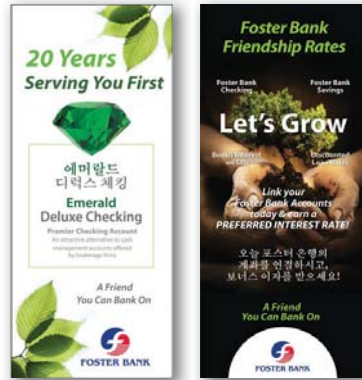
Foster Bank - English & Korean

Connect with customers around the world. Respect each culture by speaking their language. The opportunities for international business expand each and every day. Seize additional business by presenting your products and services that captivate a larger audience.