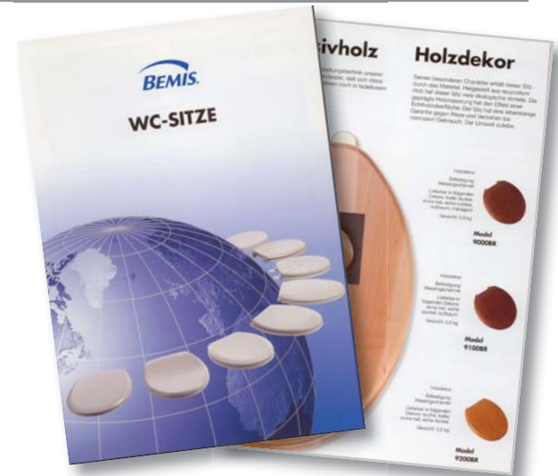
Bemis - European Product Line - English, German & French