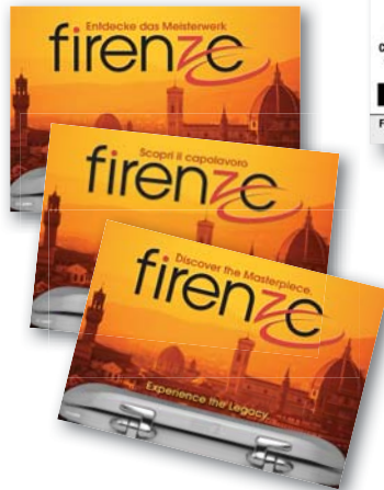
Carrara & Matta - Sales Rep Postcards - English, German & Italian