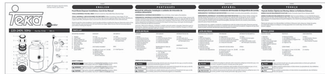
ISE - Disposer Manual - English, Spanish, Portuguese & Turkish