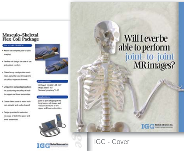
IGC - Cover