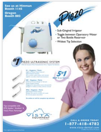
Vista Dental - Trade Ads