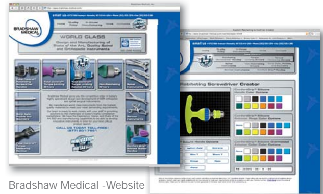
Bradshaw Medical - Website