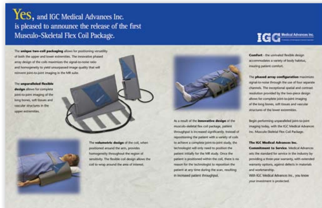
IGC Medical Advances - Joint-to-Joint Mailer Tri-Fold (Inside Spread)