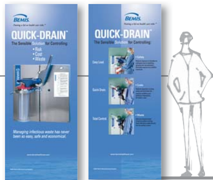
Bemis - Trade Show Banner Stands

Medical manufacturers demand all the facts; precise specifications, informative charts and dynamic graphics. Design Interchange offers a clear vision for promoting existing products and introducing new services to medical professionals.