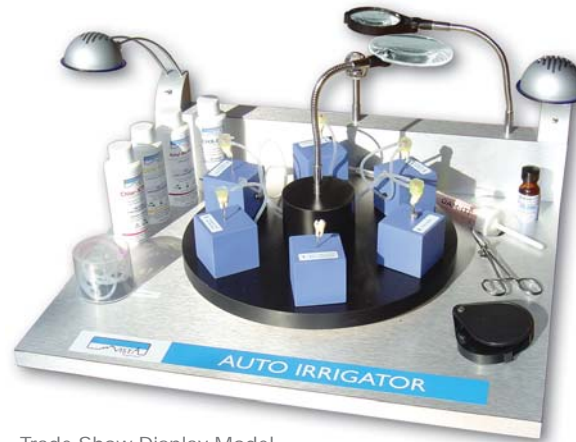
Trade Show Display Model for New Product Introduction